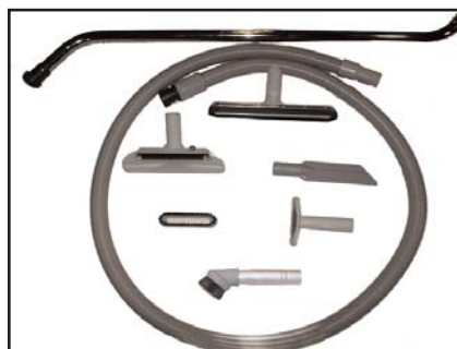
Wet/Dry Tool Kit