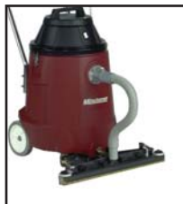
Big Gulp™ Squeegee