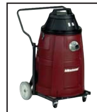
Tip N Pour